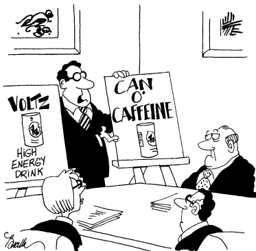
“With this approach, we just cut to the chase.”

Do You Have A Lot Of Visitors In Your Office? Then Read This To Keep Your Desk Safe....Page 4