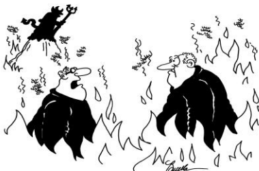
"I wrote assembly instructions for Children's toys. What did you do?"

Why Your "Not-To-Do" List Is Just As Important As Your "To-Do" List .....Page 4