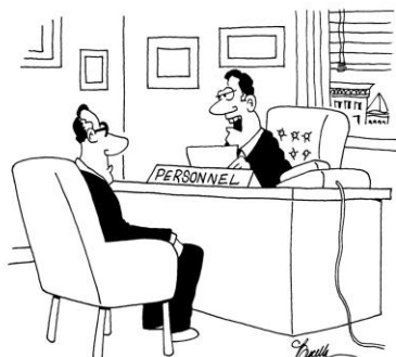
“Sorry, we just filled our ‘Financial Analyst’ position, but we do have an opening in ‘Sacrificial Lambs.’”

Are Digital Devices Dumbing Us Down?.....Page 4